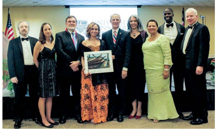
Georgia Tech, Emory University, the University of Georgia, the Carter Center, and Savannah State University were given the "United for Liberia Award."