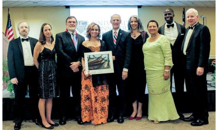
Georgia Tech, Emory University, the University of Georgia, the Carter Center, and Savannah State University were given the "United for Liberia Award."