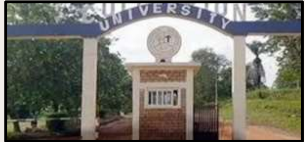
Cuttington University Main Entrance